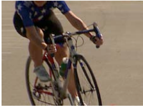
Figure 8 Drill

After a few laps in each direction, athlete mounts the bike away from the circle and pedals forward slowly and approaches the circle, steering onto the circle and riding multiple laps in both directions.